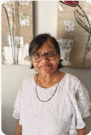
Ma'am Vino Admin / Tuckshop